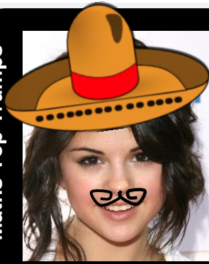
Maths Top Trumps