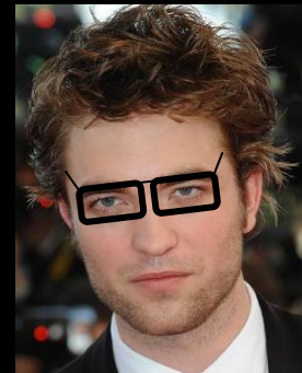
Maths Top Trumps