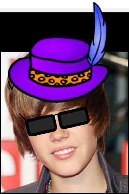
Maths Top Trumps