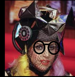
Maths Top Trumps