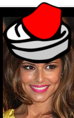
Maths Top Trumps