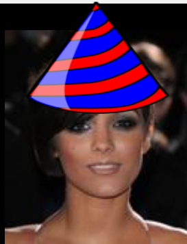
Maths Top Trumps