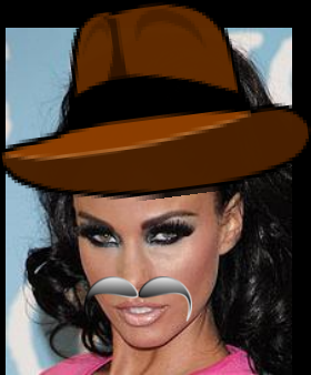
Maths Top Trumps