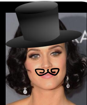
Maths Top Trumps